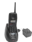
PARTNER wireless phone