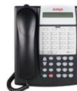
PARTNER 18-button display phone