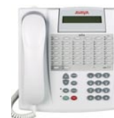
PARTNER 34-button display phone