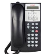
PARTNER 6-button display phone

Transfer a call...set up a conference call...create a list of frequently dialed numbers—PARTNER telephones make it easy. It's also simple to connect standard devices—no extra lines or adapters needed.